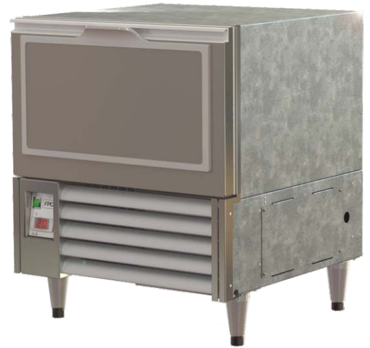
UPPER : BARISTA REFRIGERATED MILK DRAWER, FLAP OPEN, DRAWER CLOSED LOWER : BARISTA REFRIGERATED MILK DRAWER, FLAP AND DRAWER CLOSED