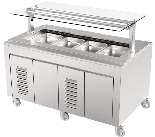
Showing : Inline GN Series Mobile refrigerated 4x 1/1 pans, fitted with flat self-serve gantry (option) and GN pans (accessories)