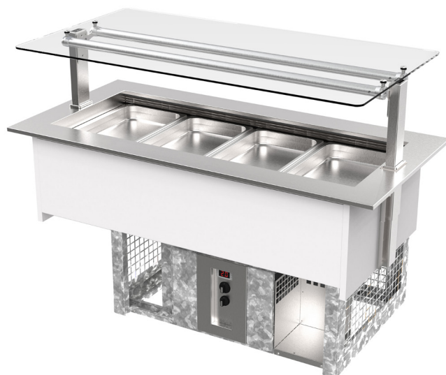
Showing : Inline GN Series refrigerated in-counter 4x 1/1 pans, fitted with flat self-serve gantry (option) and GN pans (accessories)