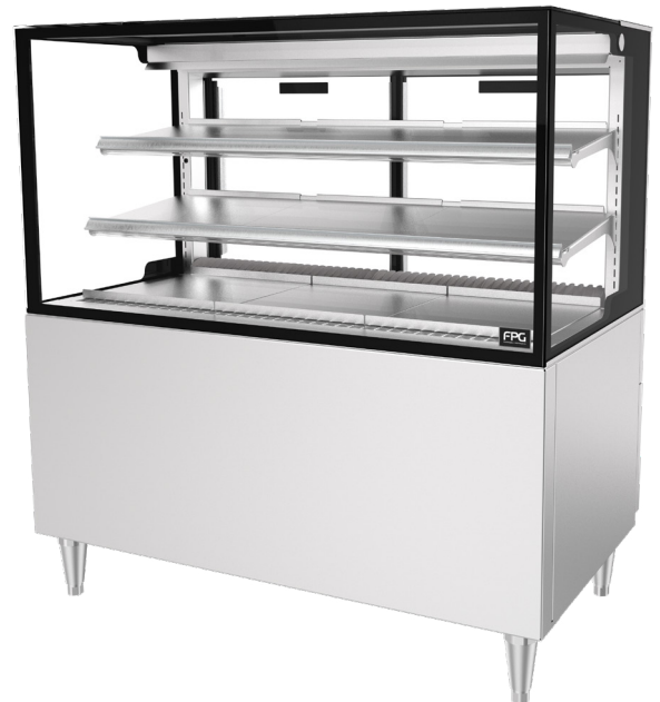
Showing : Inline 3000 Series refrigerated 1200mm square freestanding fixed front with integral refrigeration