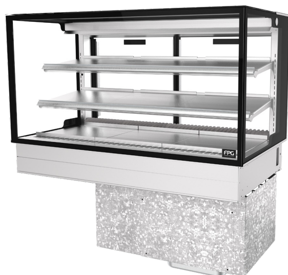
Showing : Inline 3000 Series refrigerated 1200mm square in-counter fixed front with integral refrigeration