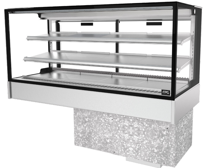
Showing : Inline 3000 Series controlled ambient 1500mm square on-counter fixed front with integral refrigeration