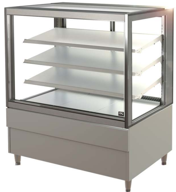
SHOWING : 4000 SERIES REFRIGERATED 1200mm SQUARE FREESTANDING, WITH FIXED FRONT, WITH INTEGRAL CONDENSING UNIT