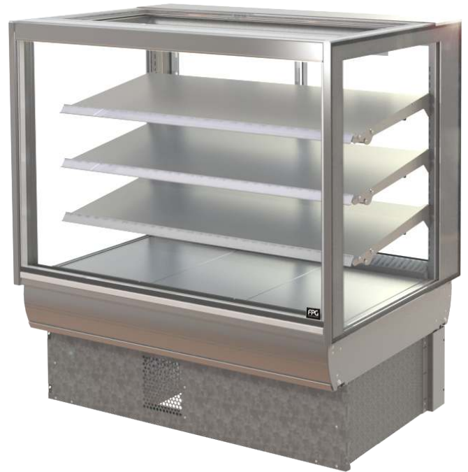
SHOWING : 4000 SERIES REFRIGERATED 1200mm SQUARE, WITH FIXED FRONT, IN COUNTER, WITH INTEGRAL CONDENSING UNIT