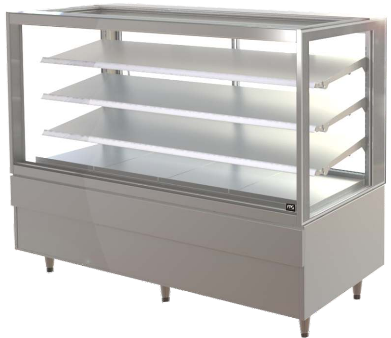
SHOWING : 4000 SERIES REFRIGERATED 1800mm SQUARE FREESTANDING, WITH FIXED FRONT, WITH INTEGRAL CONDENSING UNIT