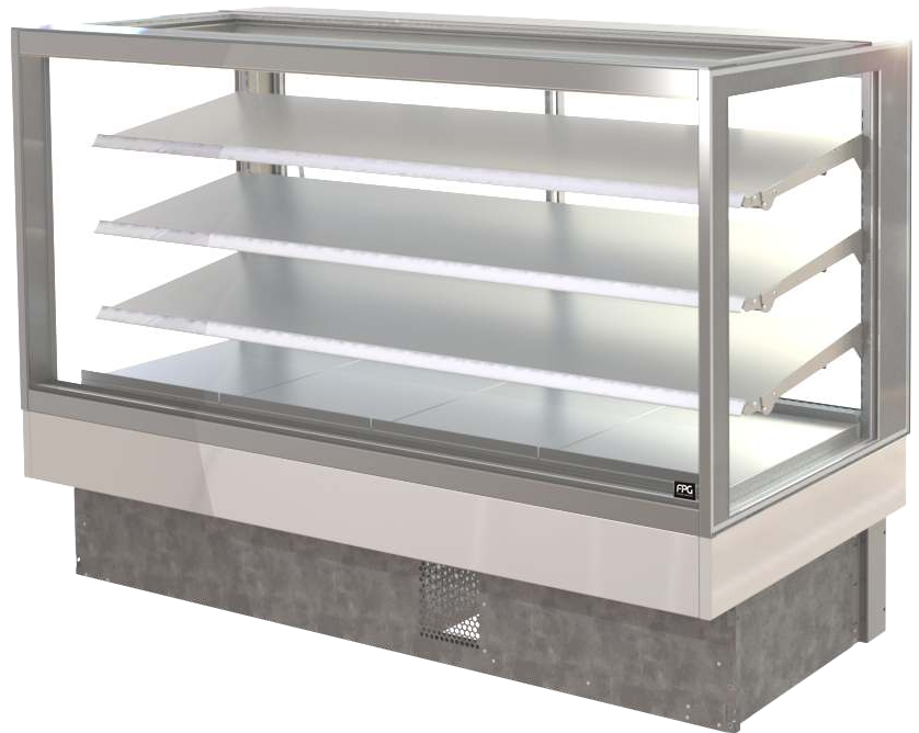
SHOWING : 4000 SERIES REFRIGERATED 1800mm SQUARE, WITH FIXED FRONT, ON COUNTER, WITH INTEGRAL CONDENSING UNIT