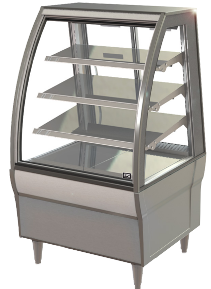
Showing : Inline 4000 Series controlled ambient 800mm curved freestanding fixed front with integral refrigeration