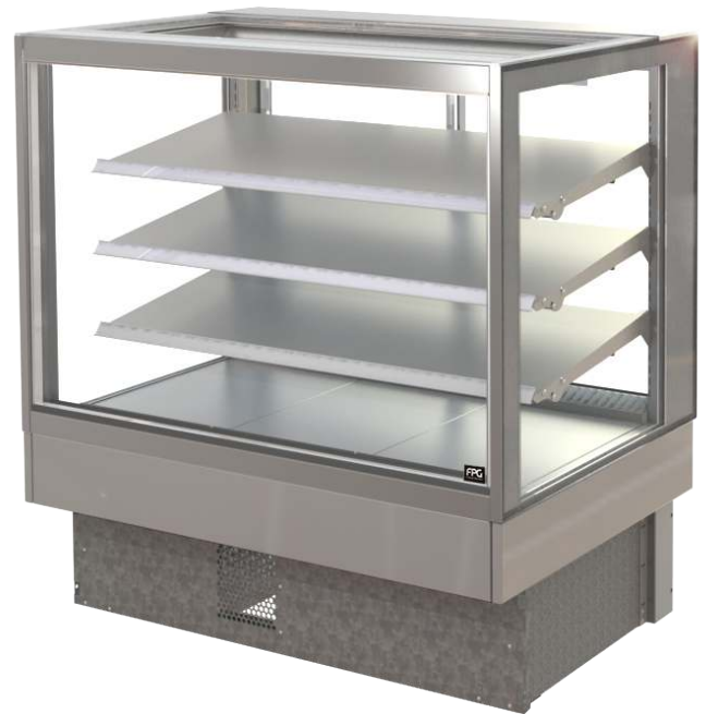
SHOWING : 4000 SERIES CONTROLLED AMBIENT 1200mm SQUARE, WITH FIXED FRONT, ON COUNTER, WITH INTEGRAL CONDENSING UNIT