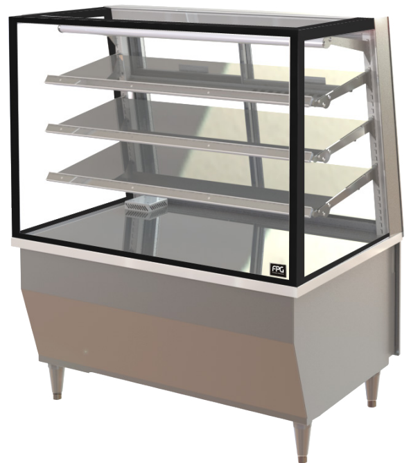
Showing : Inline 5000 Series ambient 1200mm square freestanding fixed front