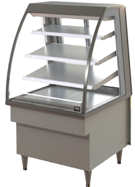
Showing : Inline 5000 Series refrigerated 800mm curved freestanding open front with integral refrigeration