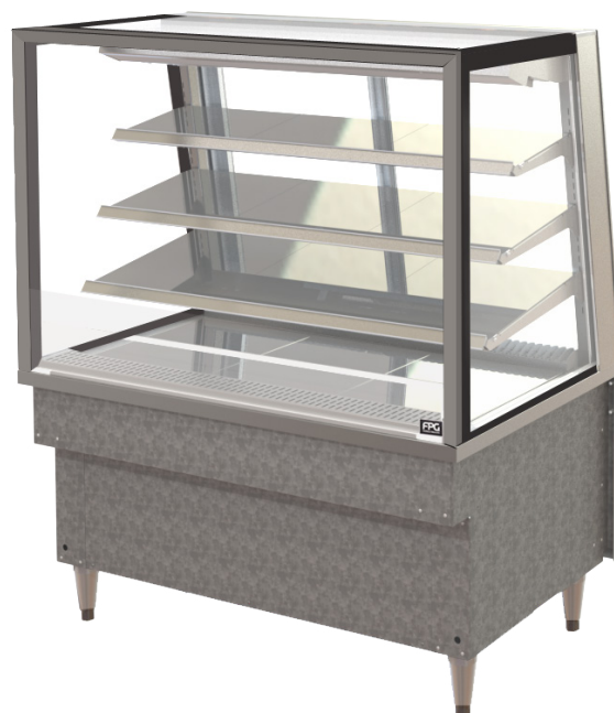
Showing : Inline 5000 Series refrigerated 1200mm square freestanding open front with integral refrigeration