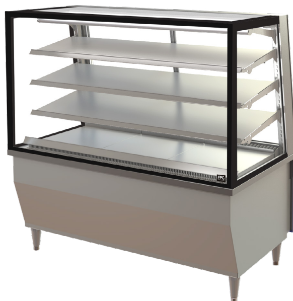
Showing : Inline 5000 Series refrigerated 1500mm square freestanding fixed front with integral refrigeration