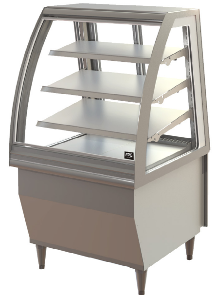
Showing : Inline 5000 Series controlled ambient 800mm curved freestanding tilt front with integral refrigeration