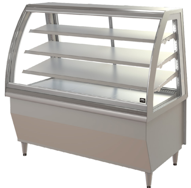
Showing : Inline 5000 Series controlled ambient 1500mm curved freestanding tilt front with integral refrigeration