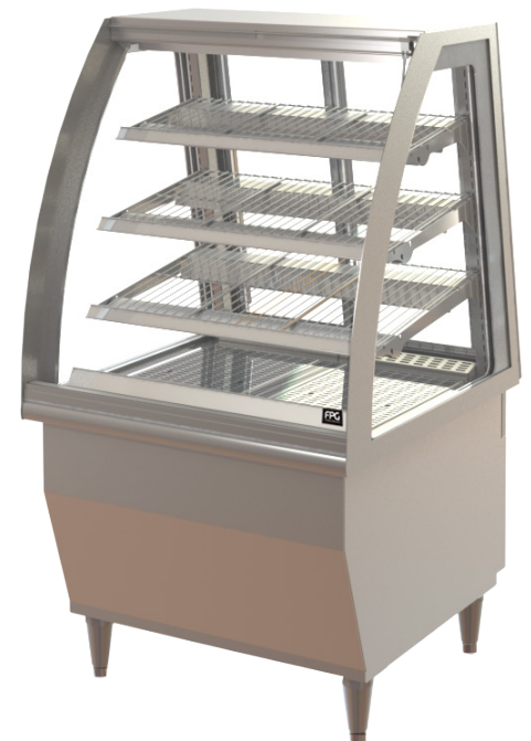
Showing : Inline 5000 Series heated 800mm curved freestanding tilt front