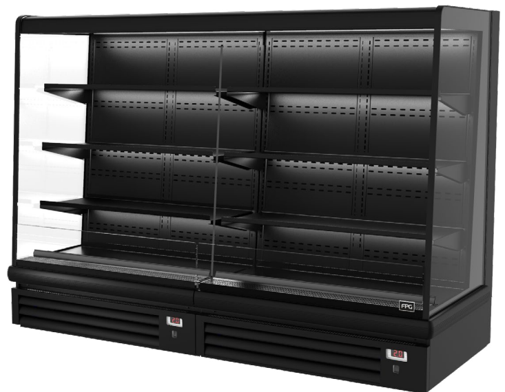
Showing : Visair Upright refrigerated 2000mm freestanding open front with three full-width shelf display levels and base